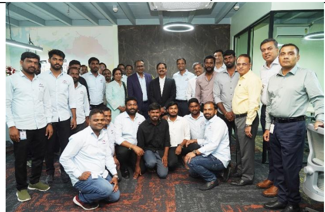
Group Photo of L&TMRHL and Trendz Workspace