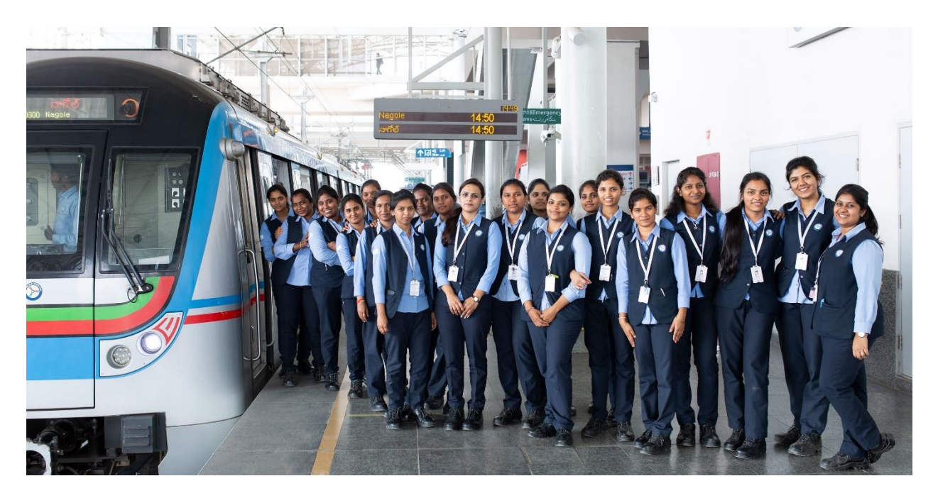
#EachforEqual – HMR – Women Train Operators celebrating International Women's Day at Ameerpet Metro Station